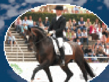
Starhill (From Starhill Donatelli)