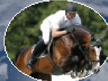
Starhill (From Starhill Donatelli)