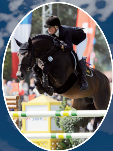
Stakkato (Spartan x Pygmalion)

IHB proudly offer a comprehensive range of the most outstanding stallions from the finest European studs. Weltmeyer, Rotspon, Sandro Hit, Jazz, Don Frederico, Alabaster, Brentano II, Escudo I, Argentinus, Tinkas Boy, Londonderry, De Niro, Fidertanz, Sandro Boy, Totilas and Dobels Cento are just a few who have become legends. We have over 150 dressage and jumping sires from which to choose, including sons of Donnerhall, Rubinstein I, Contender, De Niro, Fidermark, Landgraf I, Cathargo Z, Cornet Obolenski and Stakkato.