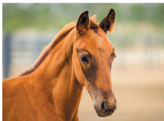
Harris Park Duhamel

Chestnut colt (embryo transfer) weanling by the Hanoverian stallion Dornkaart (Imp) (Don Primero x Pik Bube I x Lanthan) out of the AWA Ltd Main Studbook mare Harris Park Salienta (Smash Hit x Stirling Luther x Valuta), born 14 Dec 13.