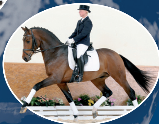
Foundation (Fidertanz x De Vito)