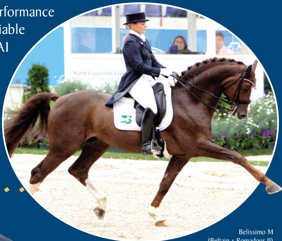
Belissimo M (Beltain x Romadour II)