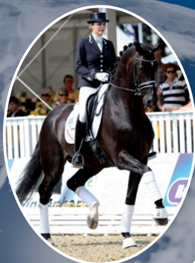
Bretton Woods (Johnson x De Niro)