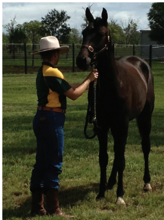
HVP Courage by NP Casino Royale (Imp) Casall La Silla x Levantos I

Our focus is on nutrition, education and overall well-being – a happy horse is a healthy horse.