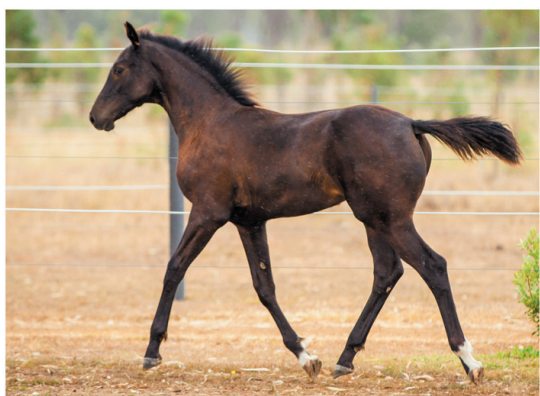
Harris Park Odette

Black filly (embryo transfer) weanling by the imported KWPN Grand Prix stallion OO Seven (Imp) (Rubinstein I x Doruto x Amor) out of the HHS Main Studbook mare Kinnordy Winona (Winterkönig x Daktylus x Goldstein), born 23 Sep 13.