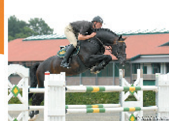
Contendro I x Che Sara xx

Australian Warmblood foal due by the premium licensed and performance tested Holsteiner stallion Contendro I (IFS) (Contender x Reichsgraf x Rasputin) out of the AWA Ltd Foundation Mare Che Sara (AUS) ( Filante xx x Sillery xx x Sir Tristram xx ), due approximately 31 Oct 14.