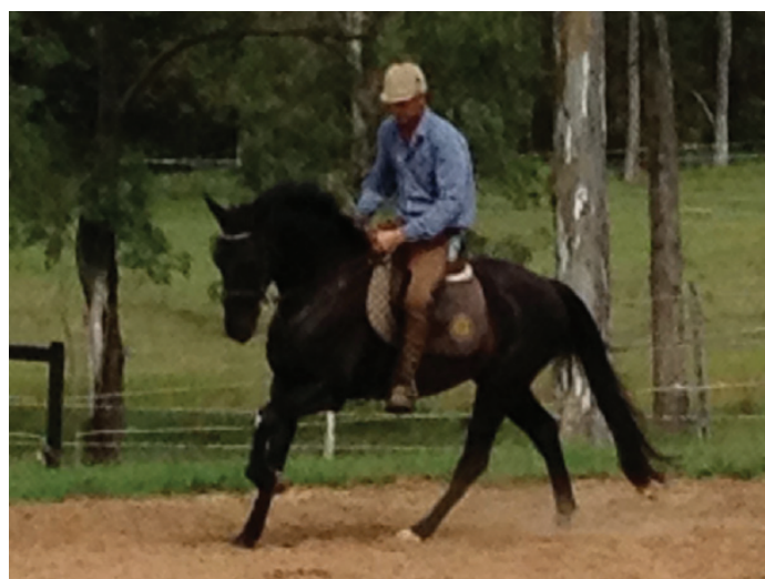
HVP Saba's Eclipse by Noblewood Park Cougar Collins (Imp) x Caletto II

Courage's success at the 2013 Trakehners Australia and AWHALtd Assessment Tour 80%.