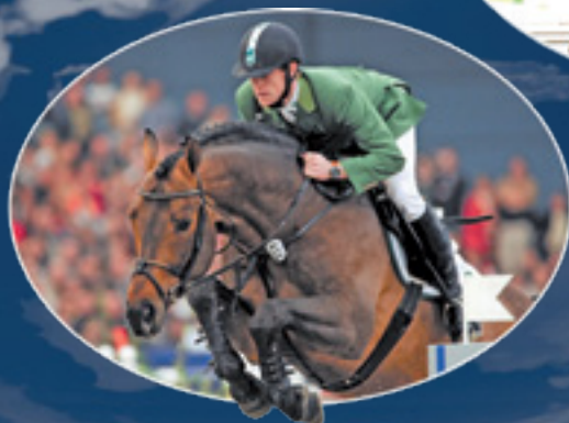
Sandro Boy (Sandro x Grannus)

IHB offers to all serious horse breeders many years of experience in the trade of frozen artificial insemination (AI), being established in 1989. They bring to Australian breeders the choice of the best stallions that the world has to offer. Their experience, technical skills and success now speaks for itself and their average conception rate of two inseminations per pregnancy is the envy of the international market.