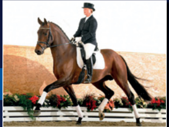
BENTLEY Belissimo M x Weltmeyer