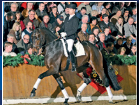
FÜRST ROMANCIER Fürst Heinrich x Romancier