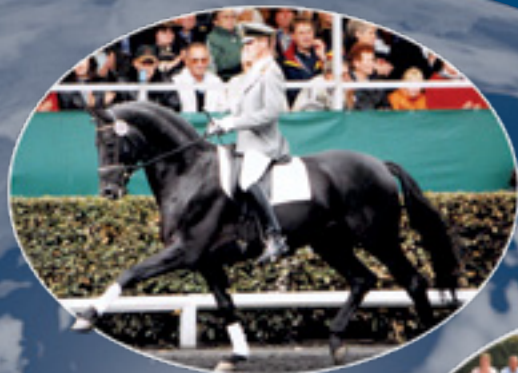
Don Frederico (Donnerhall x Consul)