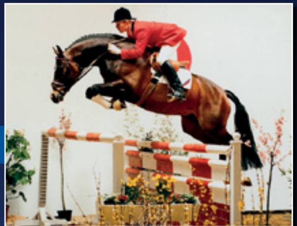
SILVIO 1 Sandro x Gepar