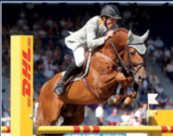
GOLDFEVER Grosso Z x Galvano