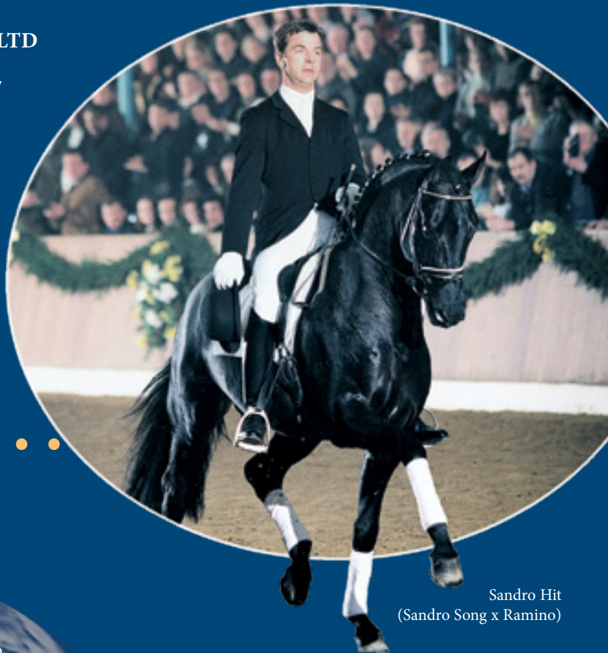
Sandro Hit (Sandro Song x Ramino)