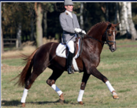
FÜRST NYMPHENBURG Florencio I x De Niro