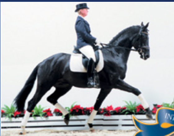
SARKOZY Sandro Hit x Weltmeyer