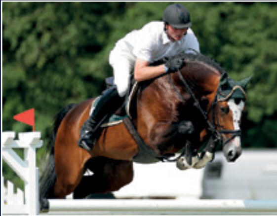
BALOU du ROUET Baloubet du Rouet x Continue