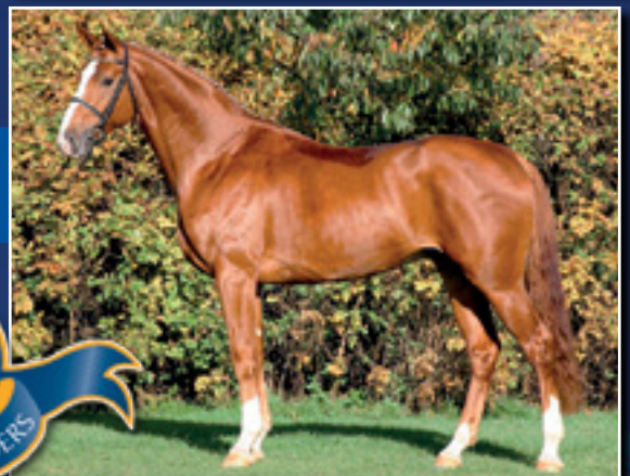
LOCKSLEY II Londonderry x Weltmeyer