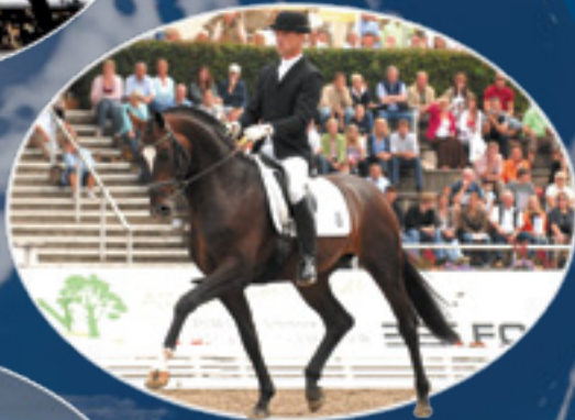
Sir Donnerhall (Sandro Hit x Donnerhall)