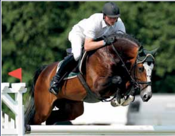
BALOU du ROUET Baloubet du Rouet x Continue