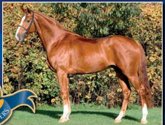
LOCKSLEY II Londonderry x Weltmeyer