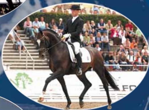
Sir Donnerhall (Sandro Hit x Donnerhall)