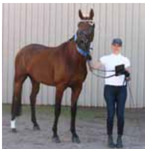
Bloomfield Royal Princ, ACE registered gelding successfully competed in dressage in VIC, photo provided.

All ACE registered horses obtain a Birth Certificate as well as a Certificate of Ownership. Eligible Mares and Stallions are entered into appropriate studbooks after assessment. Horses registered under the ACE Warmblood Register are eligible to be shown in Warmblood breed classes.