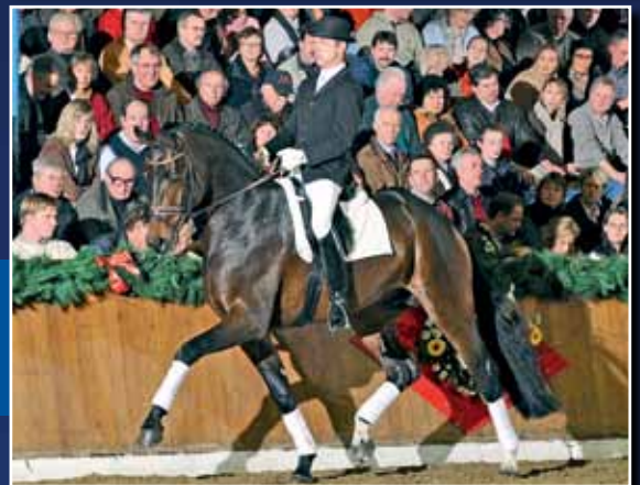
FÜRST ROMANCIER Fürst Heinrich x Romancier