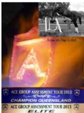
2013 ACE Champion QLD: Belcam Noblesse Oblige; filly by Now On Top imp out of Belcam Adessa

The Australian Continental Equestrian Group (ACE Group) is a Performance Horse Register and Studbook for Australian Warmblood and Performance Horses for all states of Australia.