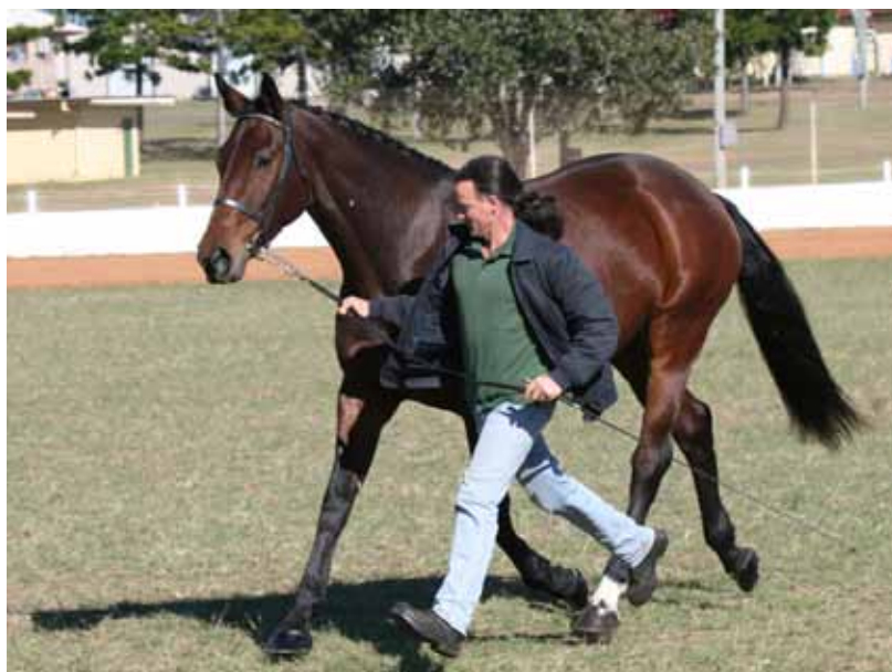
~ A mare being classified at the 2010 AWHHA QLD Branch and IHB Gala Day Show ~