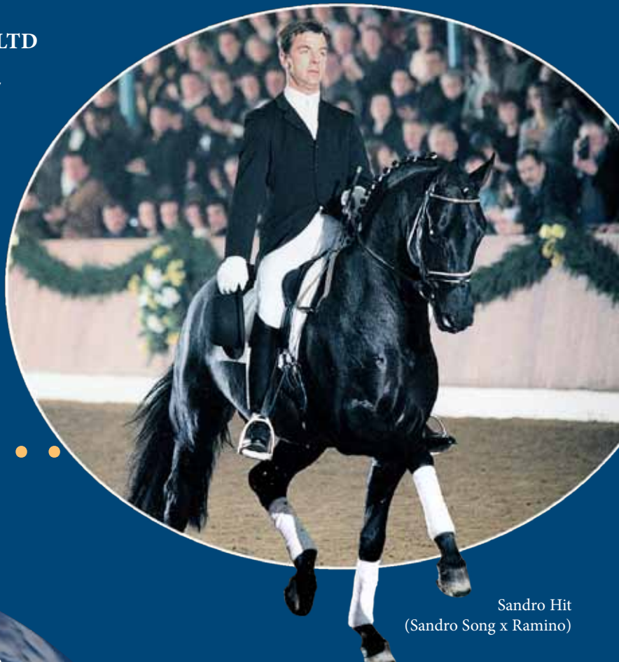
Sandro Hit (Sandro Song x Ramino)