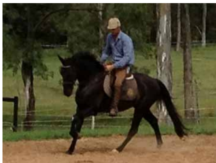
HVP Saba's Eclipse by Noblewood Park Cougar Collins (Imp) x Caletto II

Courage's success at the 2013 Trakehners Australia and AWA Ltd Assessment Tour 80% (Premium).