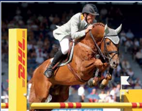
GOLDFEVER Grozso Z x Galvano