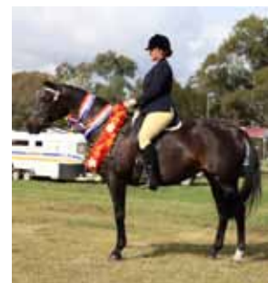
Carrington Lodge Fürsten Welt – ACE prelicenced stallion and Toowoomba Royal Show Champion Stallion 2013, photo provided.