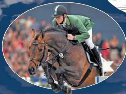
Sandro Boy (Sandro x Grannus)

IHB offers to all serious horse breeders many years of experience in the trade of frozen artificial insemination (AI), being established in 1989. They bring to Australian breeders the choice of the best stallions that the world has to offer. Their experience, technical skills and success now speaks for itself and their average conception rate of two inseminations per pregnancy is the envy of the international market.