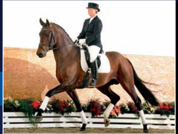
BENTLEY Belissimo M x Weltmeyer