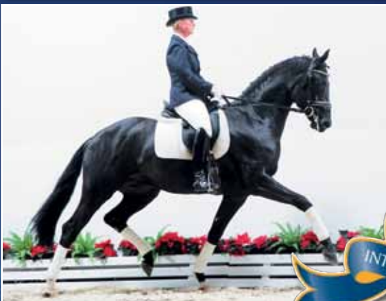
SARKOZY Sandro Hit x Weltmeyer