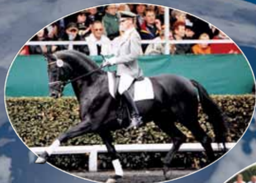
Don Frederico (Donnerhall x Consul)