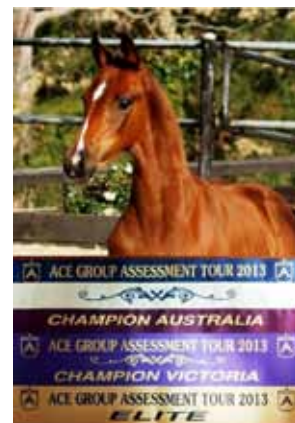
ACE Champion VIC and Australian ACE Champion: filly by Royal Hit out of Bloomfield Sirika