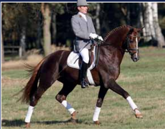
FÜRST NYMPHENBURG Florencio I x De Niro