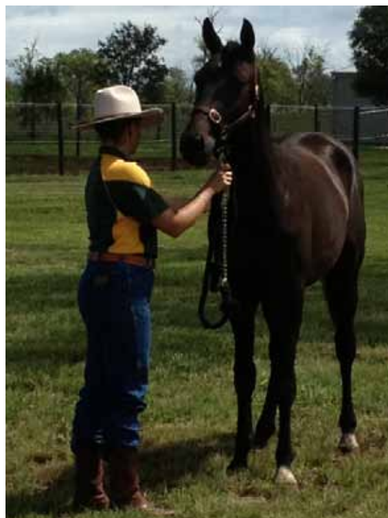
HVP Courage by NP Casino Royale (Imp) Casall La Silla x Levantos I

Our focus is on nutrition, education and overall well-being – a happy horse is a healthy horse.